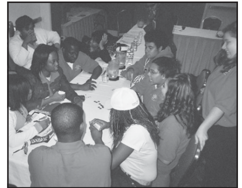
The Statewide Youth Advisory Board often breaks into teams to tackle issues and brainstorm for solutions.