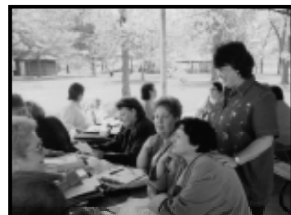
Support Specialists and Family Development Specialists map out recruitment plans.

If you need to know about a community resource, you can call your support specialist. If you have a question about training or are unsure about agency policy, contact your support specialist. If she doesn't know she will point you in the right direction for help.