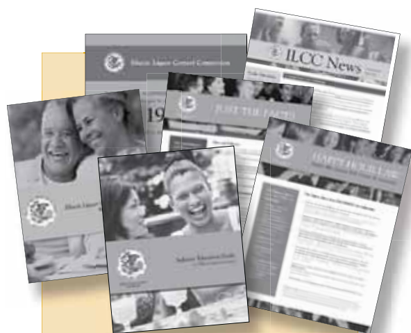
Liquor Licensee Education Packet To order call 312.814.4802

ILCC special agents supervise underage purchasers during random ID checks. These checks, which are performed throughout the State of Illinois, test retail sales personnel on their duty to perform proper ID checks in the sale of alcohol. Agents also conduct periodic compliance sweeps in conjunction with other state and local enforcement agencies to check for violations above and beyond Illinois liquor laws. Lastly, the Commission conducts random tobacco compliance checks to measure retailer compliance to minimum-age tobacco laws. Grants are also provided to local jurisdictions, who perform their own checks.