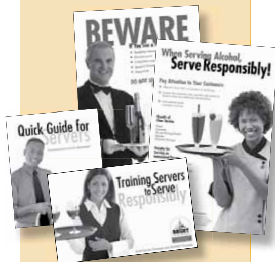
BASSET materials To order call 312.814.0773