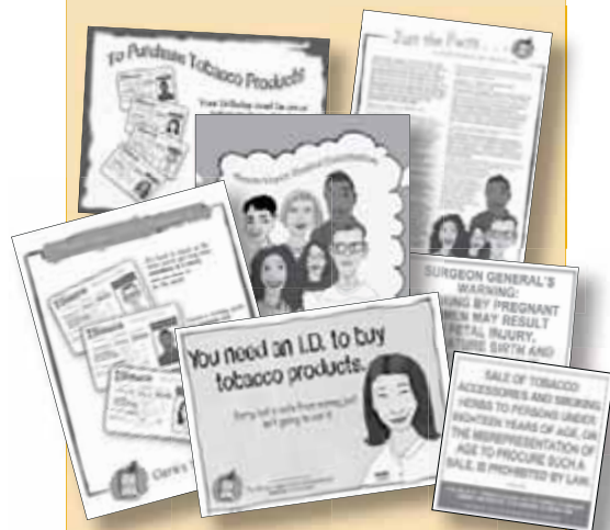
Kids Can't Buy 'Em Here Tobacco Retailer Kit To order call 312.814.6884